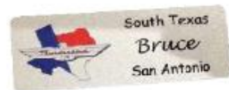
STTC Member Name Tags