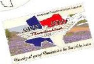
STTC Club Cards